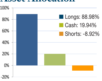
As a % of total portfolio as of 12/31/18.